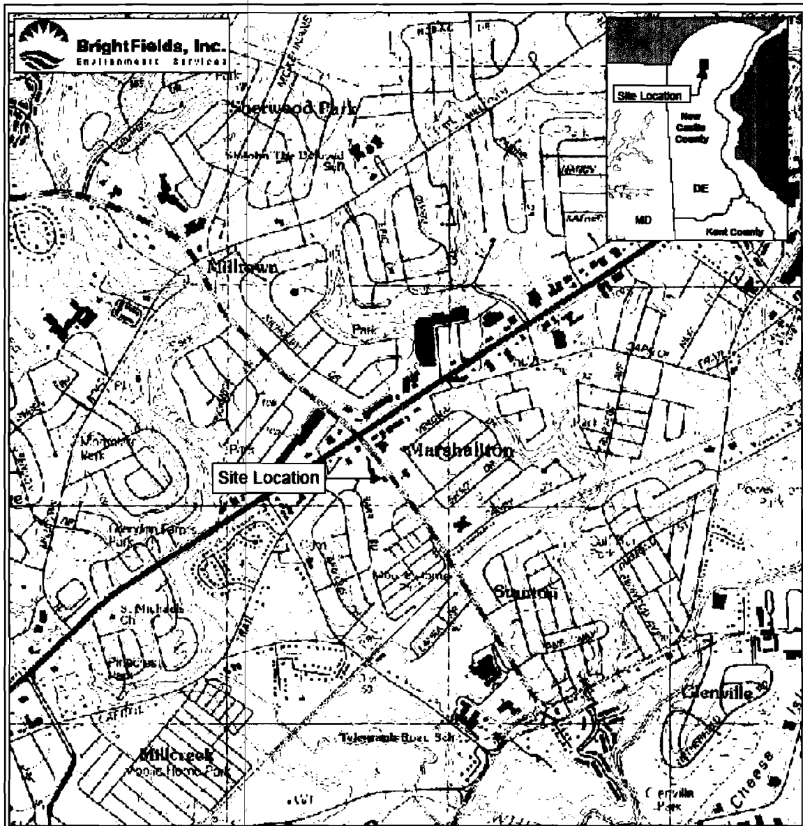
FIGURE 1 Site Location/Topographic Map USGS Topographic Quadrangle, Newark East, 1993 2060 Limestone Road Wilmington, Delaware BrightFields File: 2170.16.21